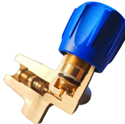
Exhibit: Gas pressure valve

In critical temperatures and media, as well as application design, we offer specific material and product design solutions.